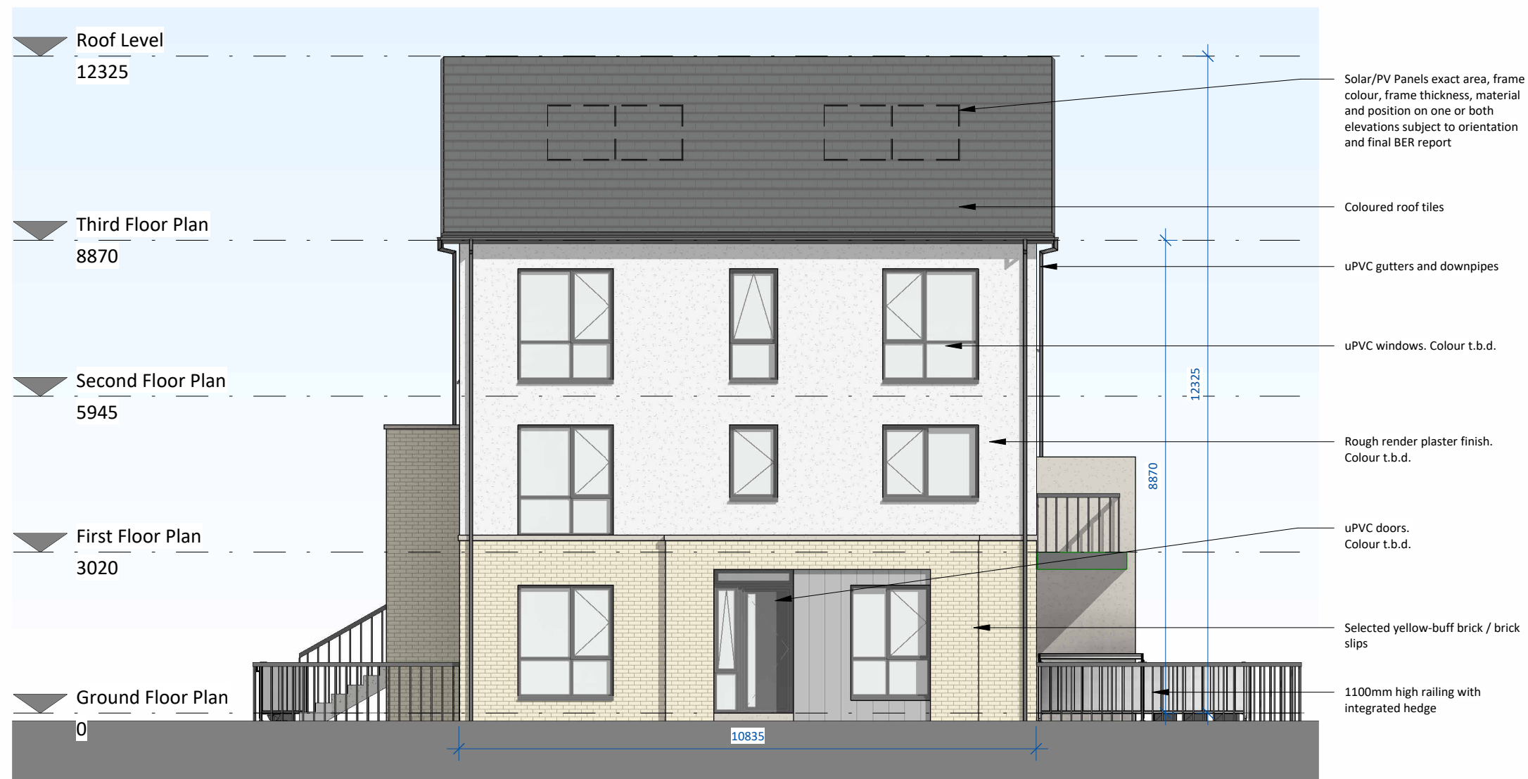
Side Elevation 01