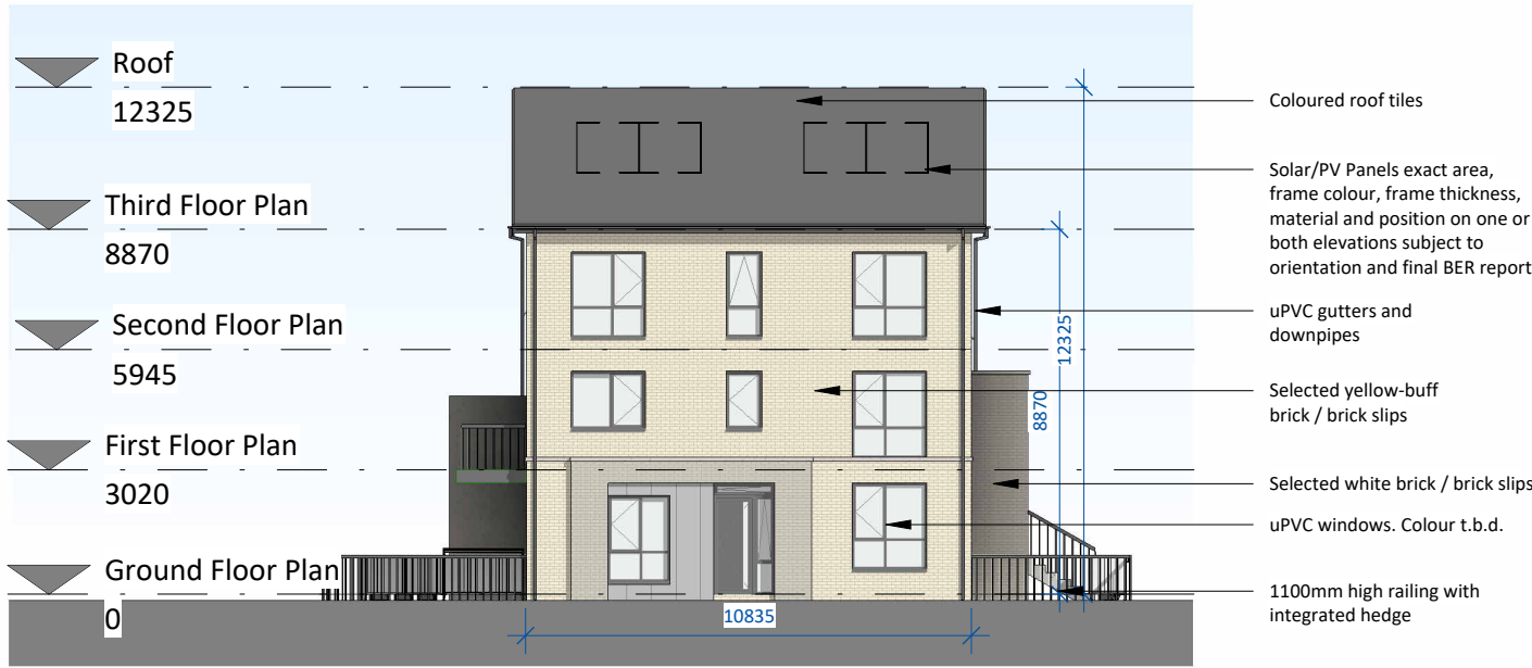
Side Elevation 02