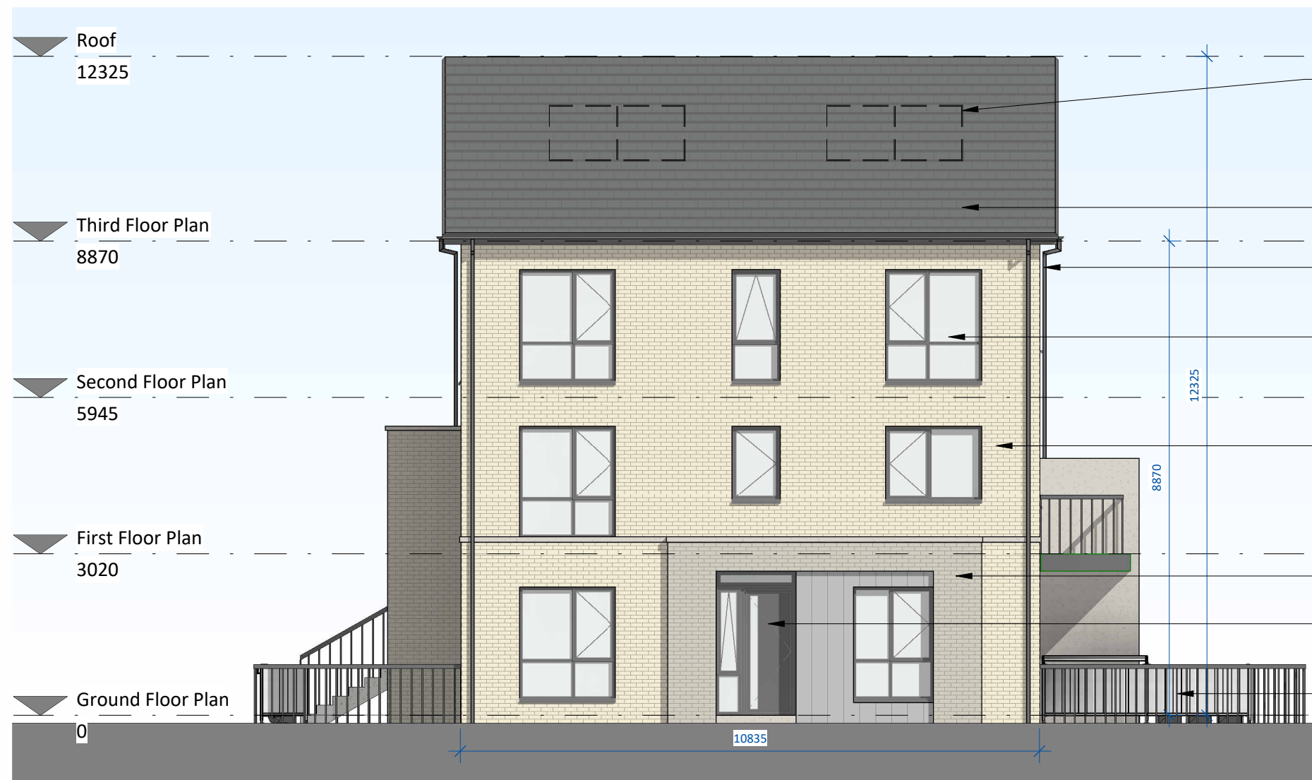
Side Elevation 01