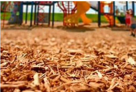
8 Resin bound engineered wood fibre for playgrounds. Comply with EN 1177 Playground Equipment and Surfacing.

© COPYRIGHT This drawing or design may not be reproduced without permission General Notes * DO NOT SCALE. USE FIGURED DIMENSIONS ONLY. * THIS DRAWING IS TO BE READ IN CONJUNCTION WITH ALL RELEVANT SPECIFICATIONS AND DRAWINGS. * ALL DIMENSIONS TO BE CHECKED ON SITE. * IN THE EVENT OF ANY DISCREPANCIES BETWEEN DRAWINGS THE CONTRACTOR IS TO INFORM THE ARCHITECT IMMEDIATELY.