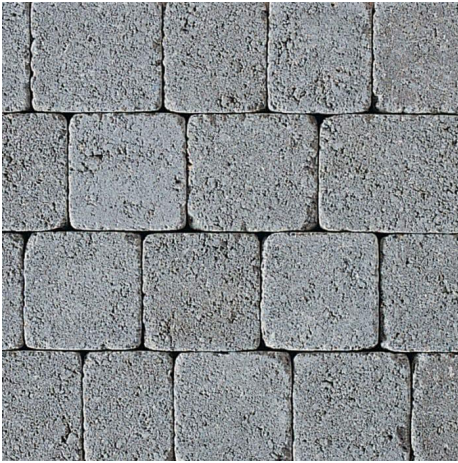
1 Concrete setts in tones of grey