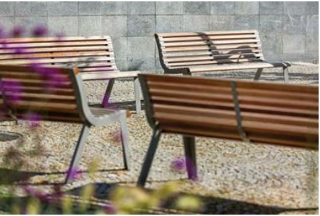
A Recycled composite timber bench on metal frame with backrest