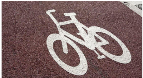
4 Tarmacadam with small red chippings to all cycle paths. All cycle paths to comply with the NTA's National Cycle Manual