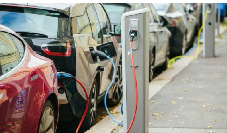
G Ducting infrastructure for electrical vehicle charging in line with SI 939:2021. Refer to drawings by INZ for more detailed information on ducting and EV charge points.