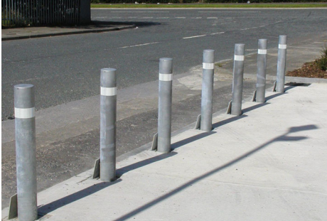
E Demountable powder-coated galvanised steel bollards