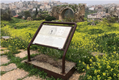
C Educational signage describing archaeological features on the site.