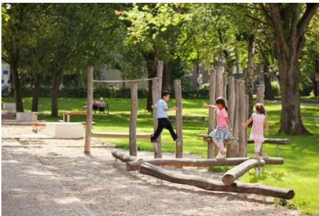
D Simple Timber Play Equipment Refer to Landscape Design Statement