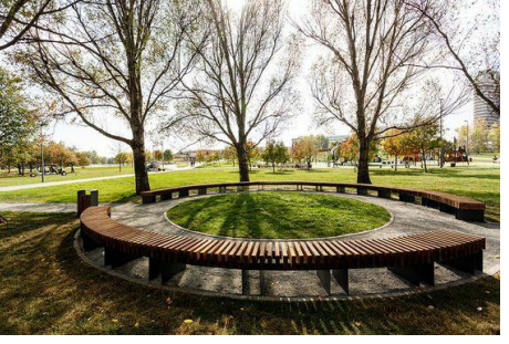
B Curved composite timber bench