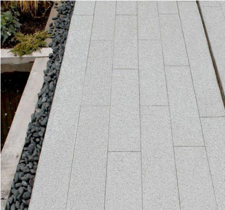
2 Pigmented concrete plank flagstones in silver grey