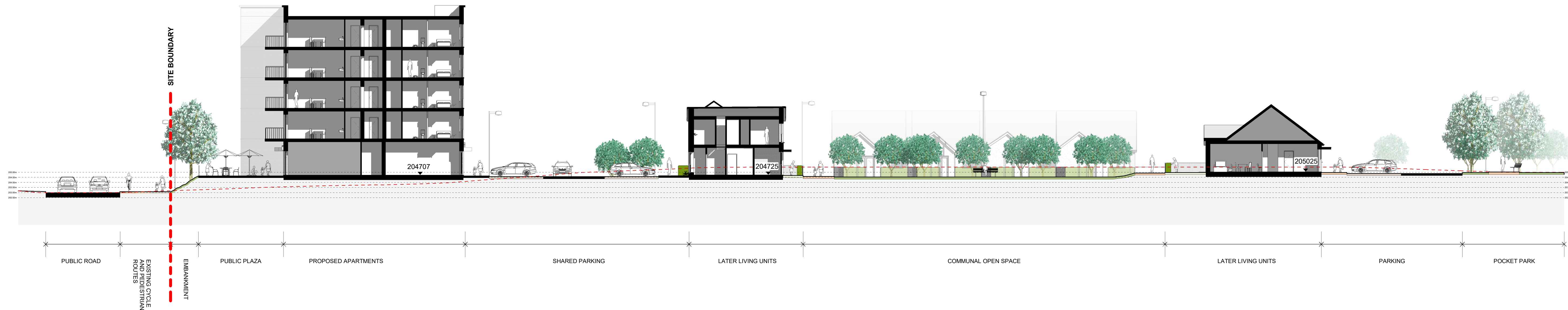
SECTION B-B THROUGH PUBLIC PLAZA, APARTMENTS & LATER LIVING UNITS

© COPYRIGHT This drawing or design may not be reproduced without permission General Notes * DO NOT SCALE. USE FIGURED DIMENSIONS ONLY. * THIS DRAWING IS TO BE READ IN CONJUNCTION WITH ALL RELEVANT SPECIFICATIONS AND DRAWINGS. * ALL DIMENSIONS TO BE CHECKED ON SITE. * IN THE EVENT OF ANY DISCREPANCIES BETWEEN DRAWINGS THE CONTRACTOR IS TO INFORM THE ARCHITECT IMMEDIATELY.